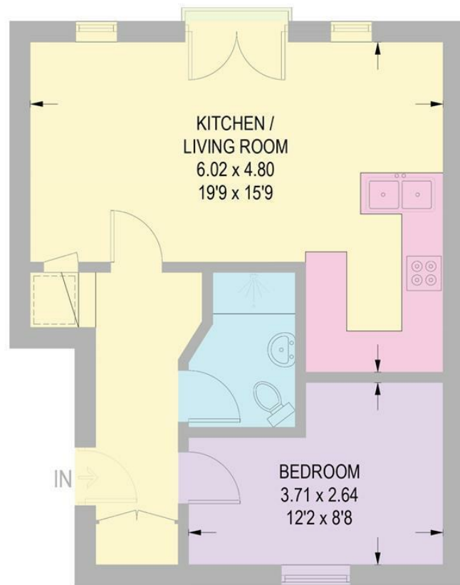
FIRST FLOOR 42.7 SQ M / 460 SQ FT

APPROXIMATE GROSS INTERNAL AREA = 79.4 SQ M / 855 SQ FT (INCLUDING EAVES)